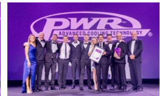
Queensland Exporter of the Year