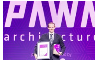
Regional Exporter PAWA Architecture