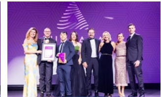
Small Business Audeara