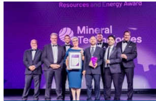
Resources and Energy Mineral Technologies