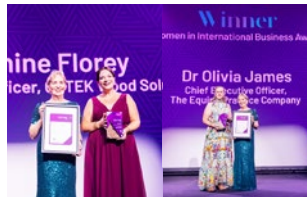
Women in International Business