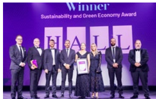
Sustainability and Green Economy Hall Contracting