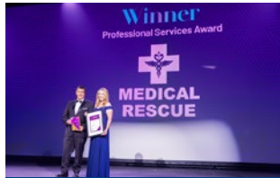
Professional Services Medical Rescue