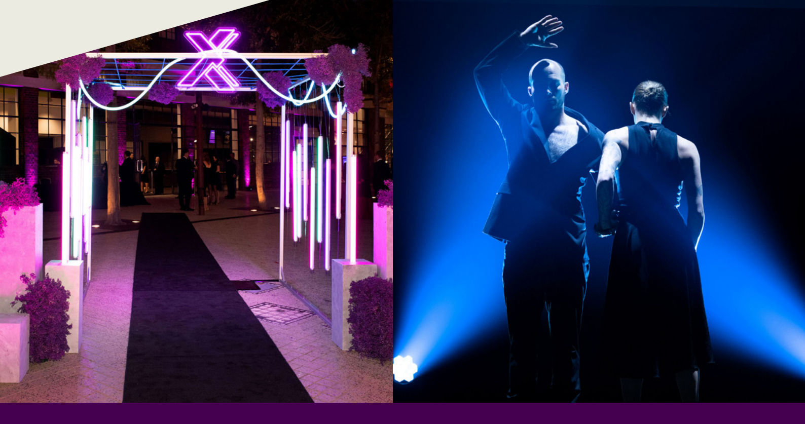
Celebrating Queensland's exporters