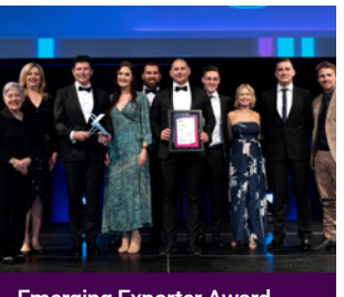
Emerging Exporter Award Plungie