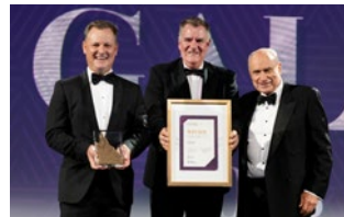
Agribusiness, Food and Beverages AgTrade

Proudly supported by Department of Agriculture and Fisheries