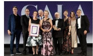
Small Business Genics