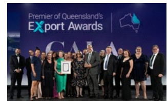
Queensland Exporter of the Year Frosty Boy Global