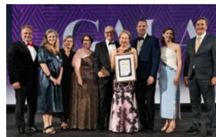
International Education and Training TAFE Queensland