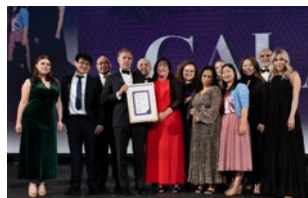
International Health Qlicksmart