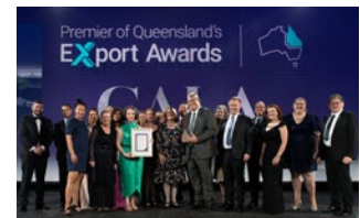
Manufacturing and Advanced Materials