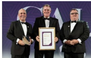
Regional Exporter Mort & Co