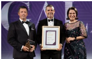
Professional Services Medical Rescue