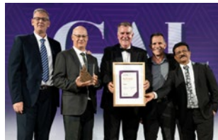
Resources and Energy Phibion