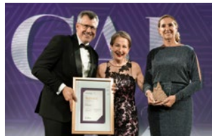
Creative Industries EventsAir