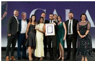
Advanced Technologies Healthcare Logic

The prestigious awards celebrate the best of our state's exporters across a number of categories.