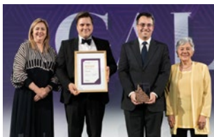
Emerging Exporter Chronosoft