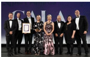
Sustainability and Green Economy Hydrobiology