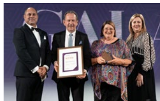
First Nations Mainie Australia