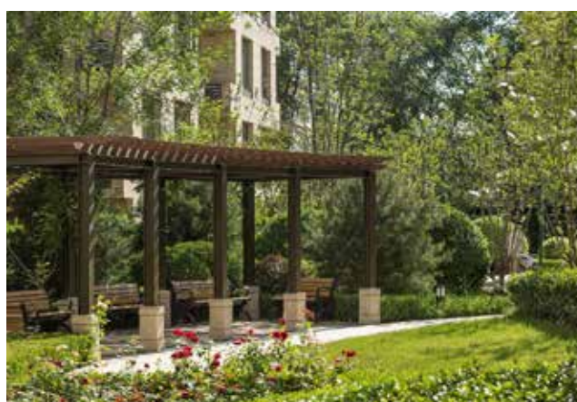
Shuangqiao Golder Homes