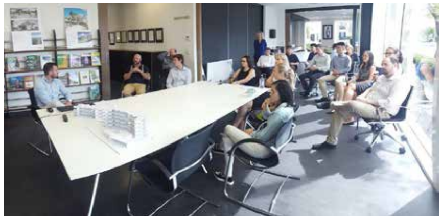
Above, from left: Physical model; Design vision internal workshop