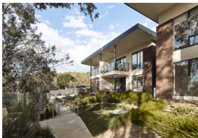
MiCare 741 Luxury Retirement Apartments