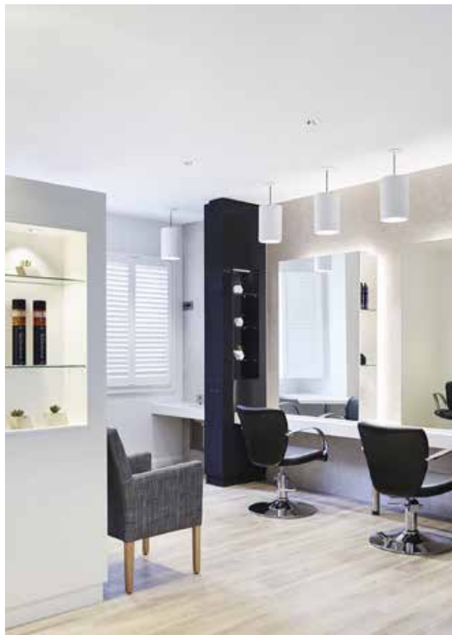
TriCare Cypress Gardens