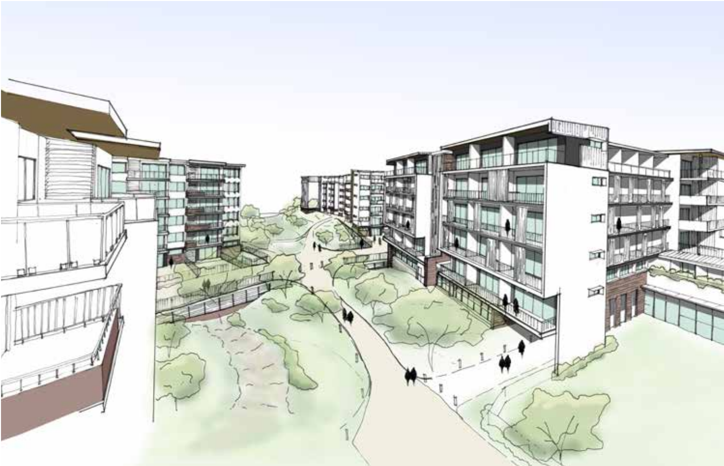
Concept sketch of retirement village