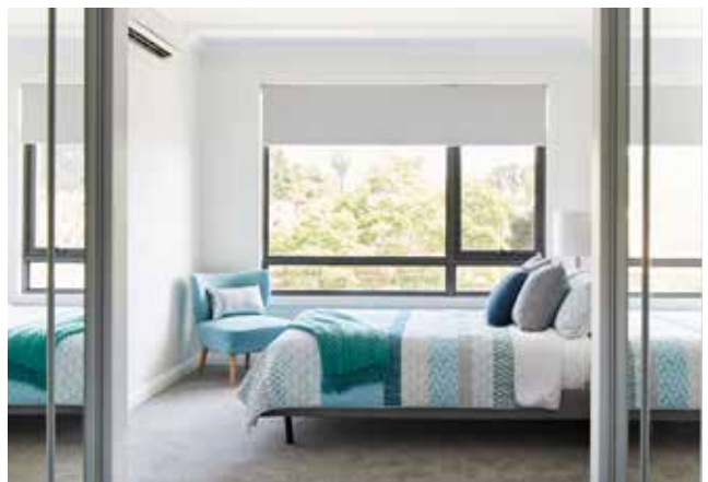
Macquarie Lodge Aged Care Plus Centre and Retirement Village – Stage 2