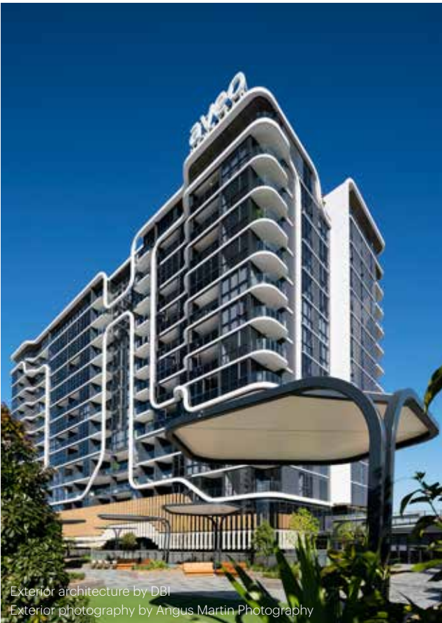
Exterior architecture by DBI